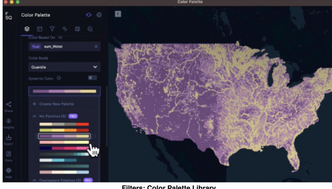
Filters: Color Palette Library Vector Tile Style Improvements

Users can now save <u>custom color palettes</u> to personal libraries. Organization members can save color palettes to a shared library.